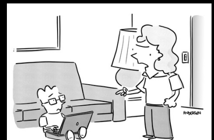
“Here’s what you’re going to do. You’re going to give those 3 million people their credit card numbers back and you’re going to say you’re sorry.”